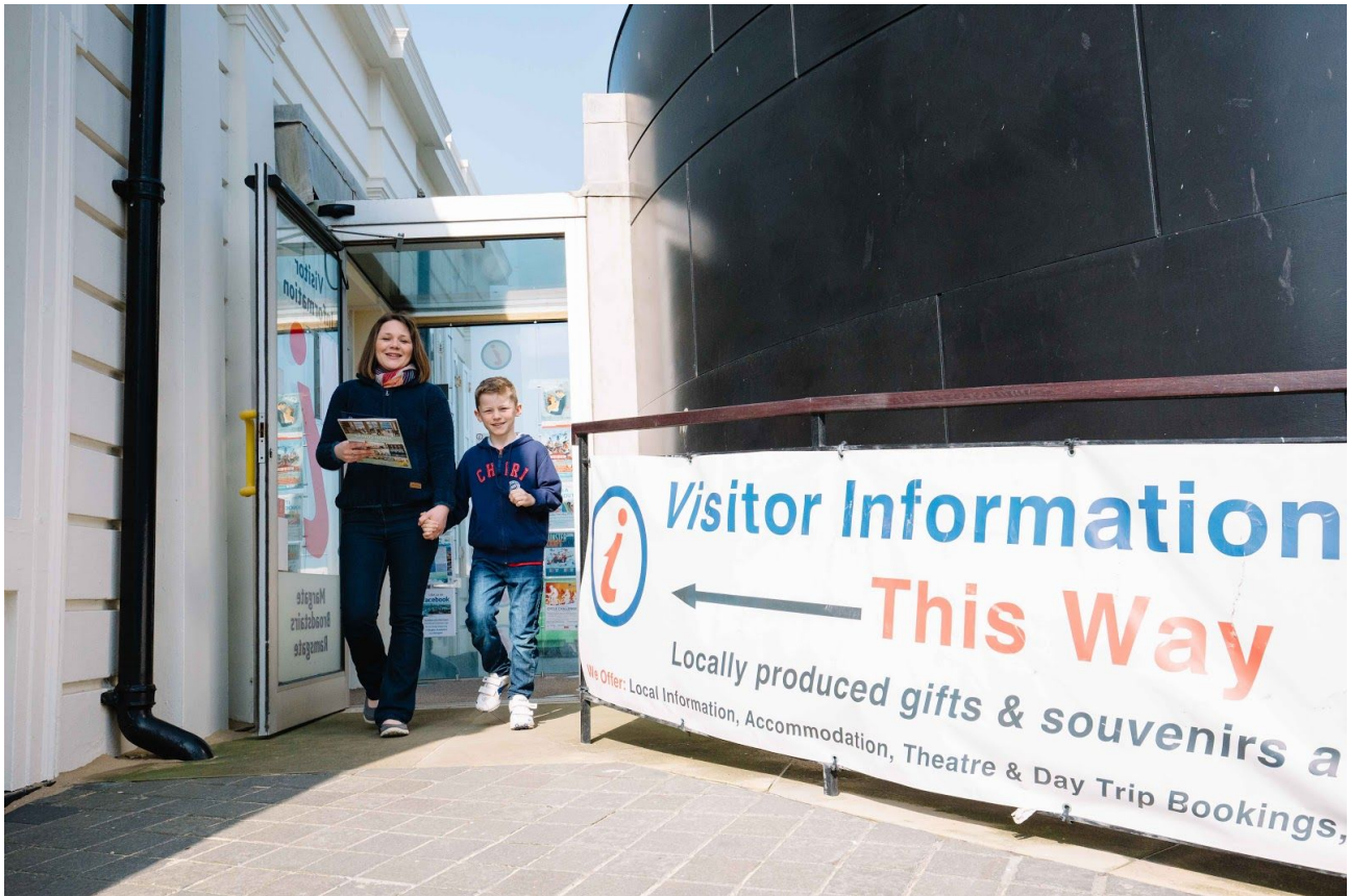
Side Entrance (accessible)