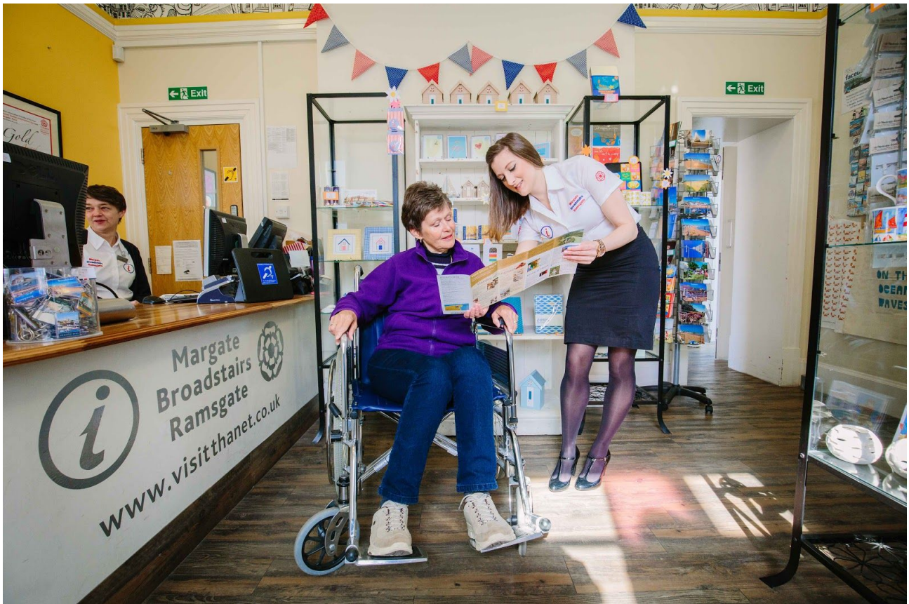
View of inside the Information Centre

wheelchair users or pushchairs to manoeuvre. The floor is flat and laminated. We do not play music, so can provide a quiet space.