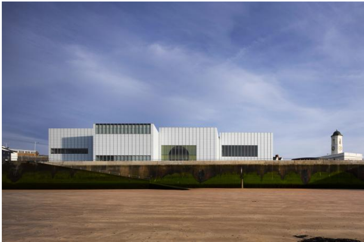
The Turner Contemporary

You'll have worked up an appetite, so cross the road to Peter's Fish Factory . Even in autumn the queue often snakes out front, but you'll get cracking fish and chips for about a fiver. Then walk the narrow streets of the Old Town , lined with cosy cafes, vintage shops and modern homewares. Try Ramsay & Williams for ice cream and antiques, the Greedy Cow for real hot chocolate ( thegreedycow.co.uk ) and Môr for stylish designs ( mormargate.com ). Next, head to Haeckels , a beauty store and treatment room opposite the derelict lido. The products are made with seaweed plucked from the beach ( haeckels.co.uk ).