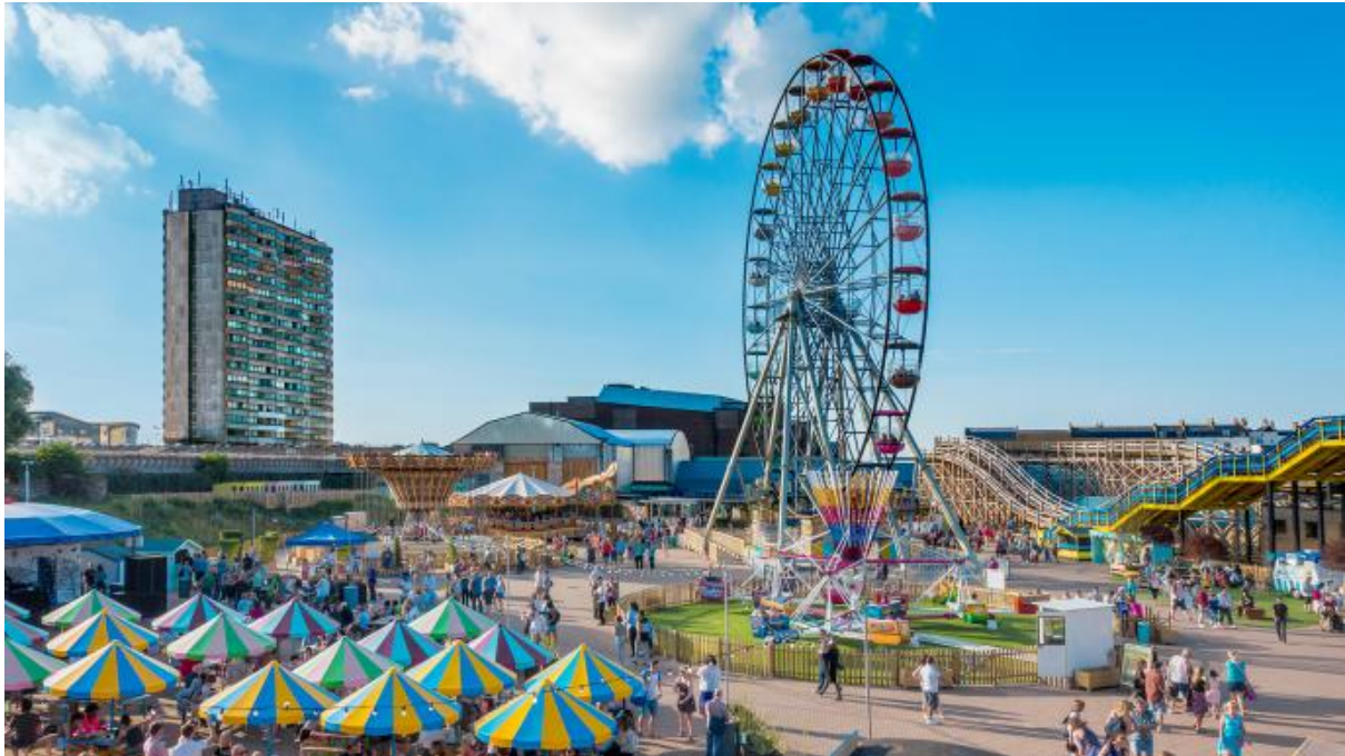
Magic circle: Dreamland has new rides as well as vintage favourites

It's retro, arty and hip — with chippies and a theme park, too