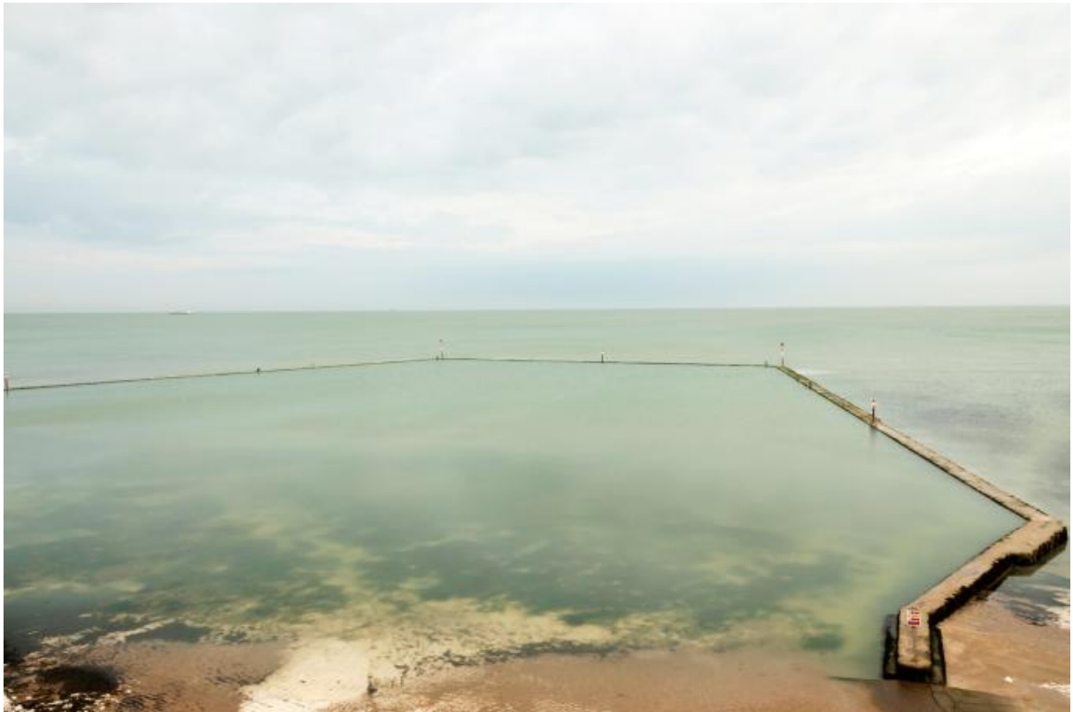
Walpole Bay tidal pool