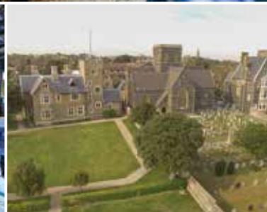
The Grange, St Augustine and Pugin Shrine and Visitor Centre

For group visit ideas and information go to www.visitthanet.co.uk/groups or call 01843 577577