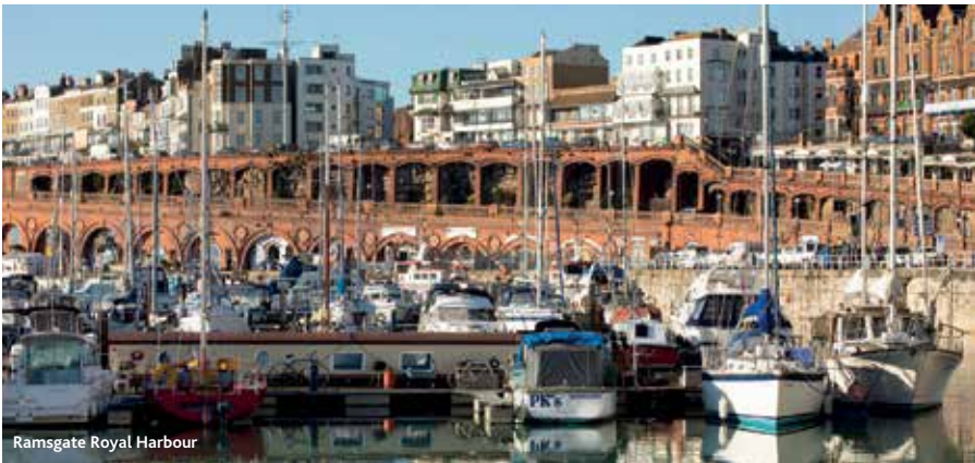
Ramsgate Royal Harbour