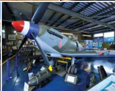
Spitfire and Hurricane Museum