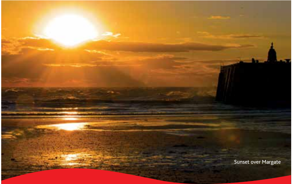
Sunset over Margate

We can provide assistance with itinerary planning and destination literature. Free images for tour planners', website and promotional material are available on request.