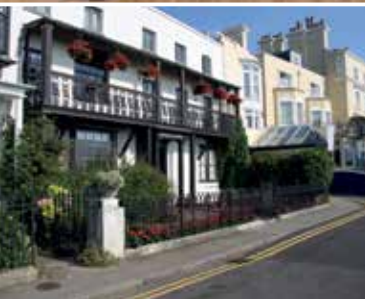
Dickens House Museum