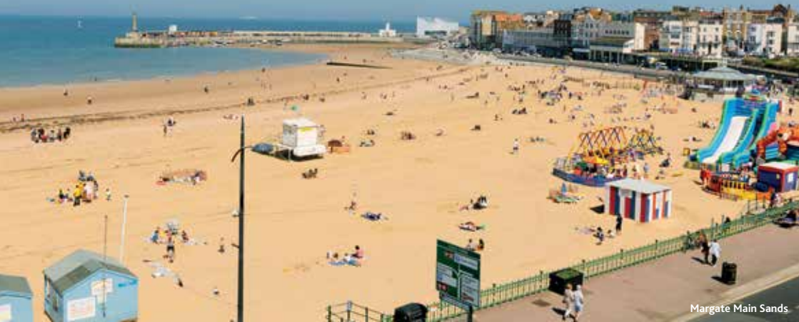
Margate Main Sands