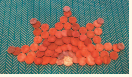
Coins from our piggy bank.