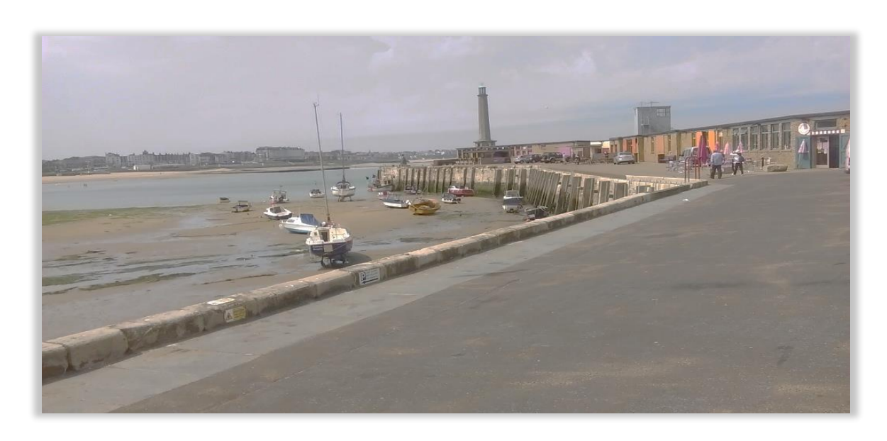
Stone Pier, Margate Harbour