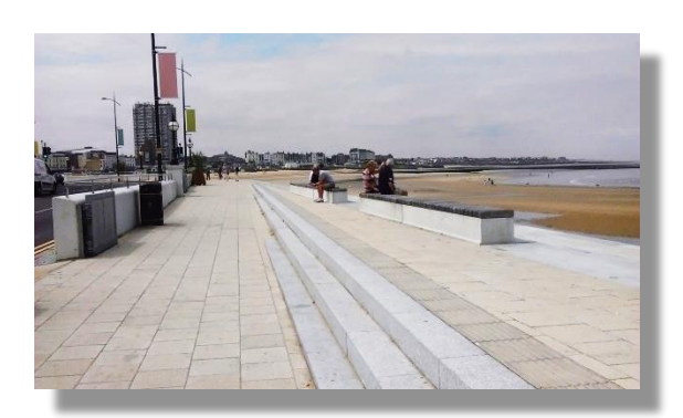
Benches above the Revetment Steps