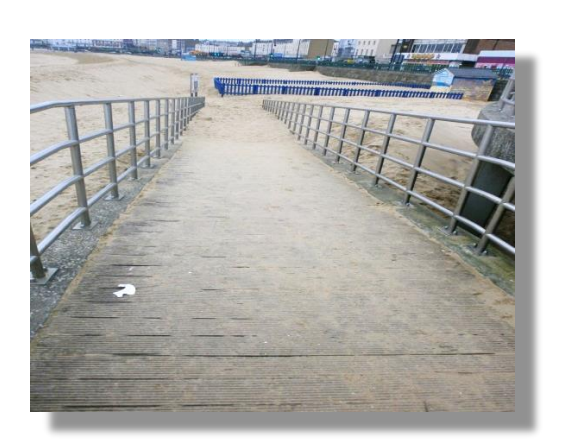
Wooden Sloped Access