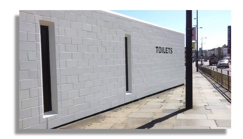
Main Toilet Block Housing Disabled Toilet

For all details on public toilets on or around our seafronts please go to the Councils website and click on the following links - <a href="http://thanet.gov.uk/your-services/street-care-and-cleaning/public-toilets/lists-of-toilets-in-thanet/">http://thanet.gov.uk/your-services/street-care-and-cleaning/public-toilets/lists-of-toilets-in-thanet/</a>