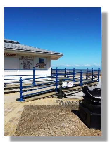
Marine Sands Cafe