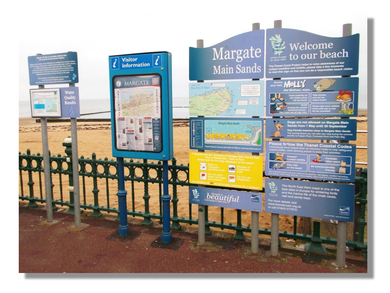
Beach & Visitor Information Signs